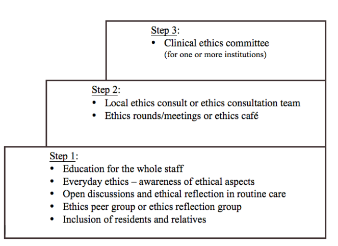
Figure 1. A three-step approach to ethical deliberation and decision-making in nursing homes

Based on a review of the literature and the authors' experiences, our suggestion is a three-step approach to ethical decision-making in nursing homes (Figure 1, modified and adapted from [10]). The steps can be individualized to meet different needs as well as geographical conditions. For a small rural nursing home, education and open discussions might be a good start, whereas large institutions in big cities might need their own ethics committee or ethics consultation team. It is possible to use all three steps in one nursing home. A model of good practice for systematic ethics works, which includes all three steps shown in Figure 1, is the Caritas Socialis (CS) in Vienna, Austria, which has nursing homes, palliative care and home care services [44, p. 146-150]. The CS has successfully included systematic ethics work throughout the whole organization since 2007, and frequently uses ethics meetings with residents to aid decision-making for frail residents [11,44]. In Norway in 2006, Bergen Red Cross Nursing Home established its own ethics guidelines [45].